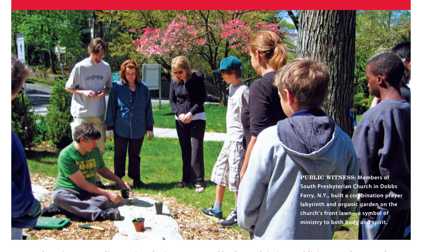
Presbyterians are rediscovering the importance of both proclaiming and living out the gospel.